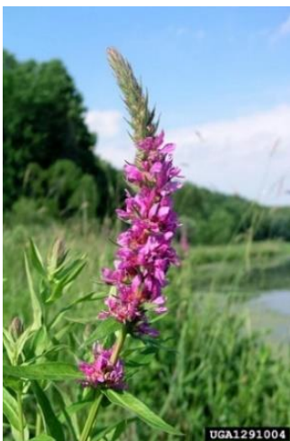
Purple loosestrife in bloom

Purple loosestrife will begin blooming soon! To identify purple loosestrife, look for a square stem, opposite long and pointy leaves, and pink-purple flowers with 5-6 petals growing close to the stem. As in past years, the Discovery Center will continue to monitor purple loosestrife. We clip flower heads to prevent seeds from spreading. We also release “cella beetles” onto large stands of purple loosestrife. Cella beetles eat only purple loosestrife and are a means to decrease overall plant height and seed production in large infestation areas. The Discovery Center rears these beetles in controlled areas, and releases them near the end of the summer. If you are interested in volunteering for purple loosestrife monitoring and control or think you have found purple loosestrife on the Chain, please contact Emily at the Discovery Center.