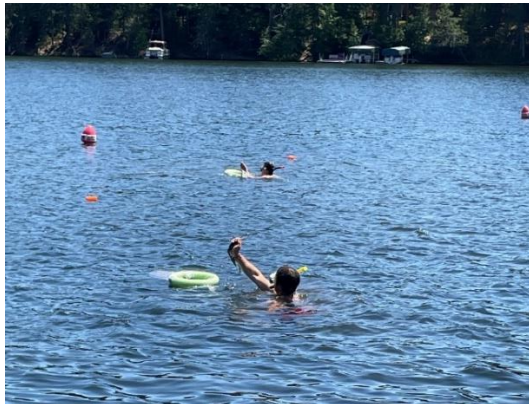
NLDC interns removing CLP on Fawn Lake