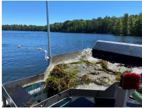
View of DASH boat from the surface of Fawn Lake

Continuation of monitoring and management of CLP is vital to preventing proliferation of CLP throughout the Manitowish Chain of Lakes. With the support of the Town of Manitowish Waters and the Manitowish Waters Lakes Association, we will continue to protect our lakes against the spread of aquatic invasive species such as curly-leaf pondweed.