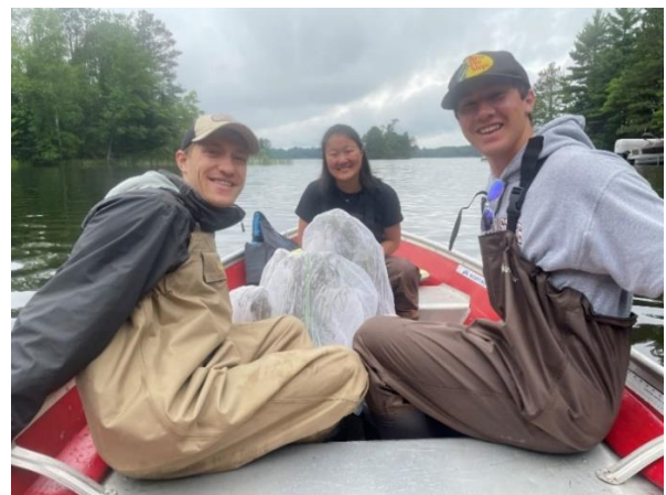
NLDC interns heading out to release cella beetles on Rice Creek