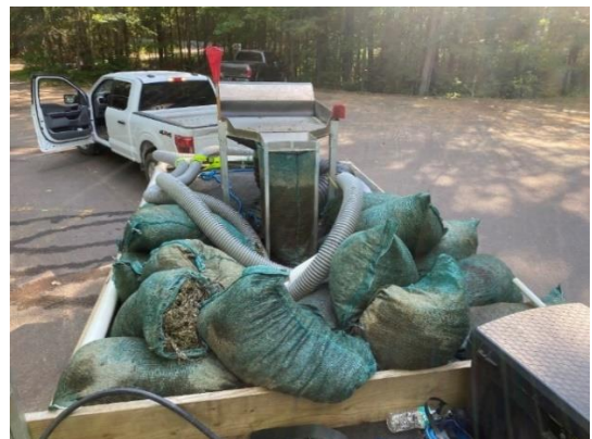
Final harvest of CLP via DASH on Fawn

The early season aquatic invasive species (AIS) surveys have been completed on the Chain. Curly-leaf pondweed (CLP) was found on the north end of Rest Lake, Fawn, the southeast end of Island, Stone, Rice Creek, the Spider-Island channel, and the Rest-Stone Channel. We have found CLP at each of these locations in the past, and no new locations were found.